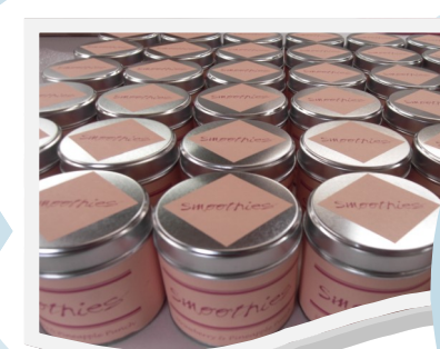
Candle tins labelled and ready for sale