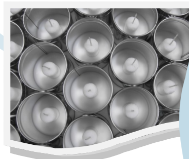
Tins with a slug and wick to ensure wick stays central