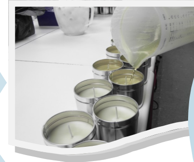
Scented wax being poured into candle tin