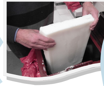
5kg slab of wax being Inserted into the vat